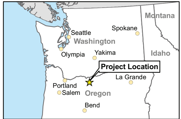
FIGURE X-1 Noise Contours (Siemens 2.3 MW Turbines) Lotus Works Energy Wasco County, Oregon